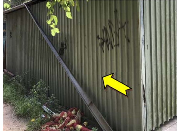
Photo 2. Exterior, throughout. walls – suspected lead-containing green upper paint system.