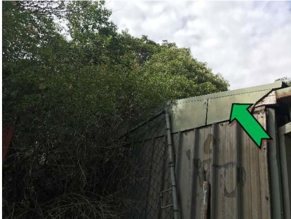
Photo 1. Exterior, garage throughout, wall lining – non asbestos-containing fibre cement sheeting.